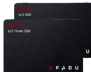
U.2 and U.3